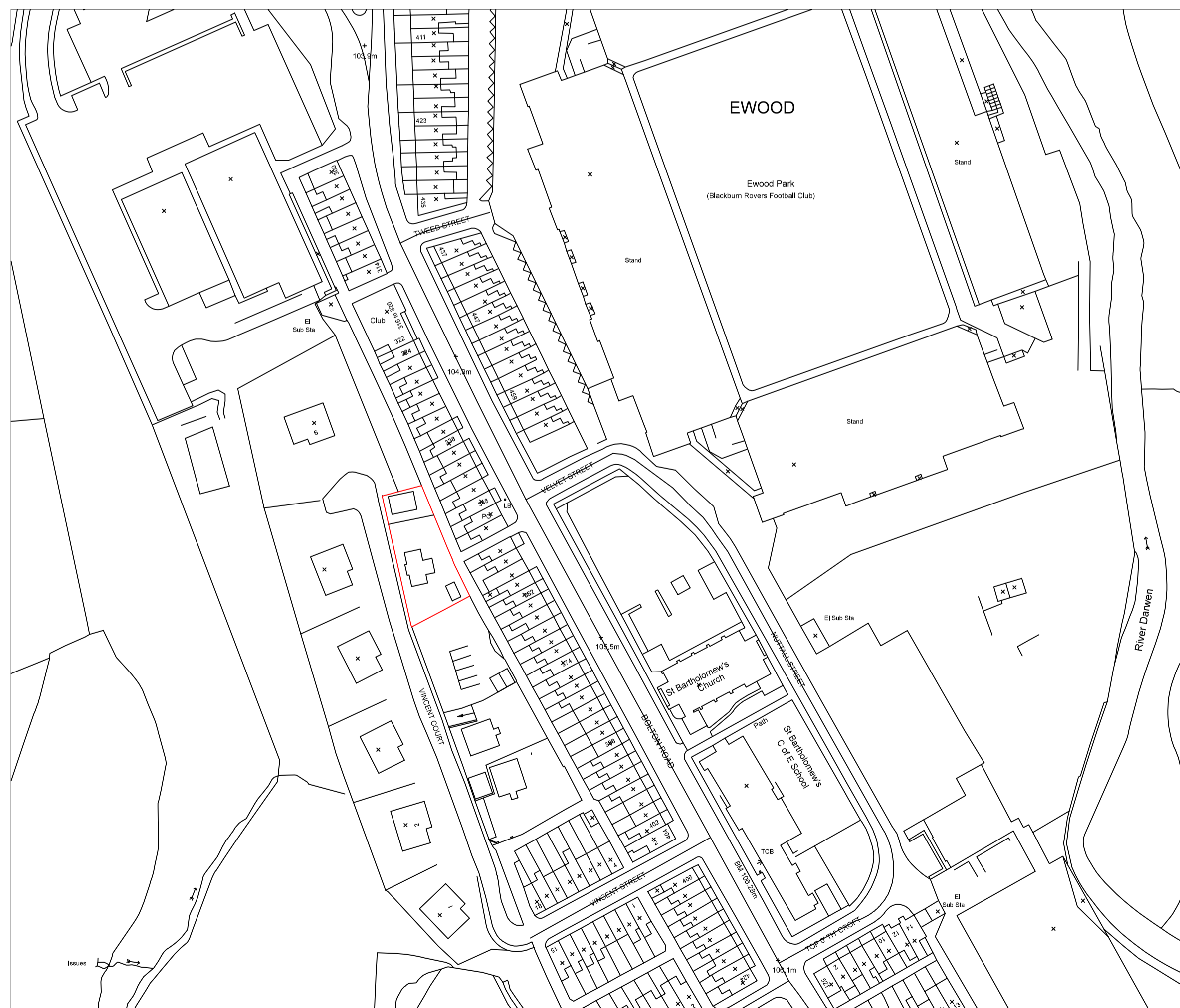
EXISTING LOCATION PLAN SCALE 1:1250