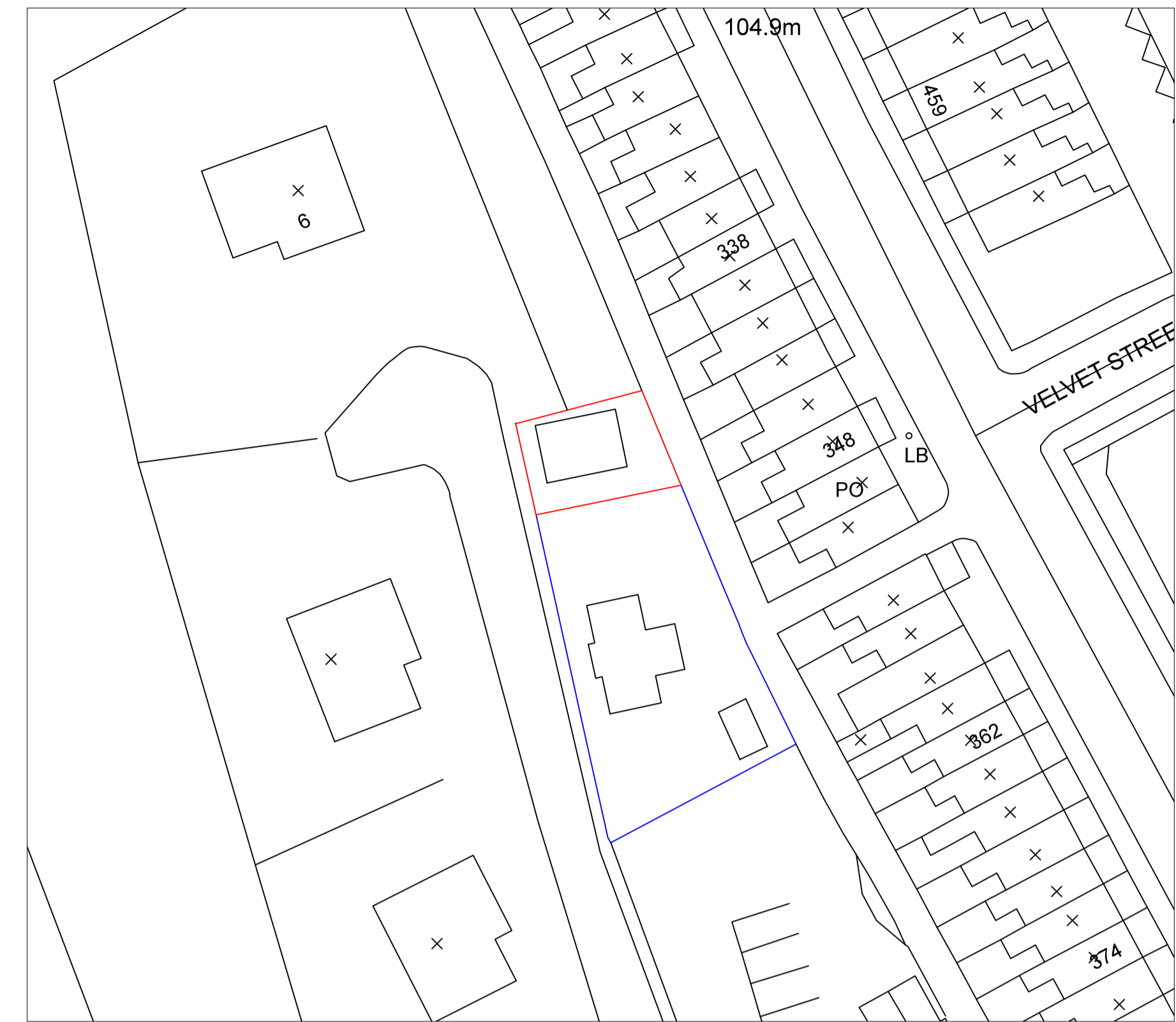
PROPOSED SITE PLAN SCALE 1:500